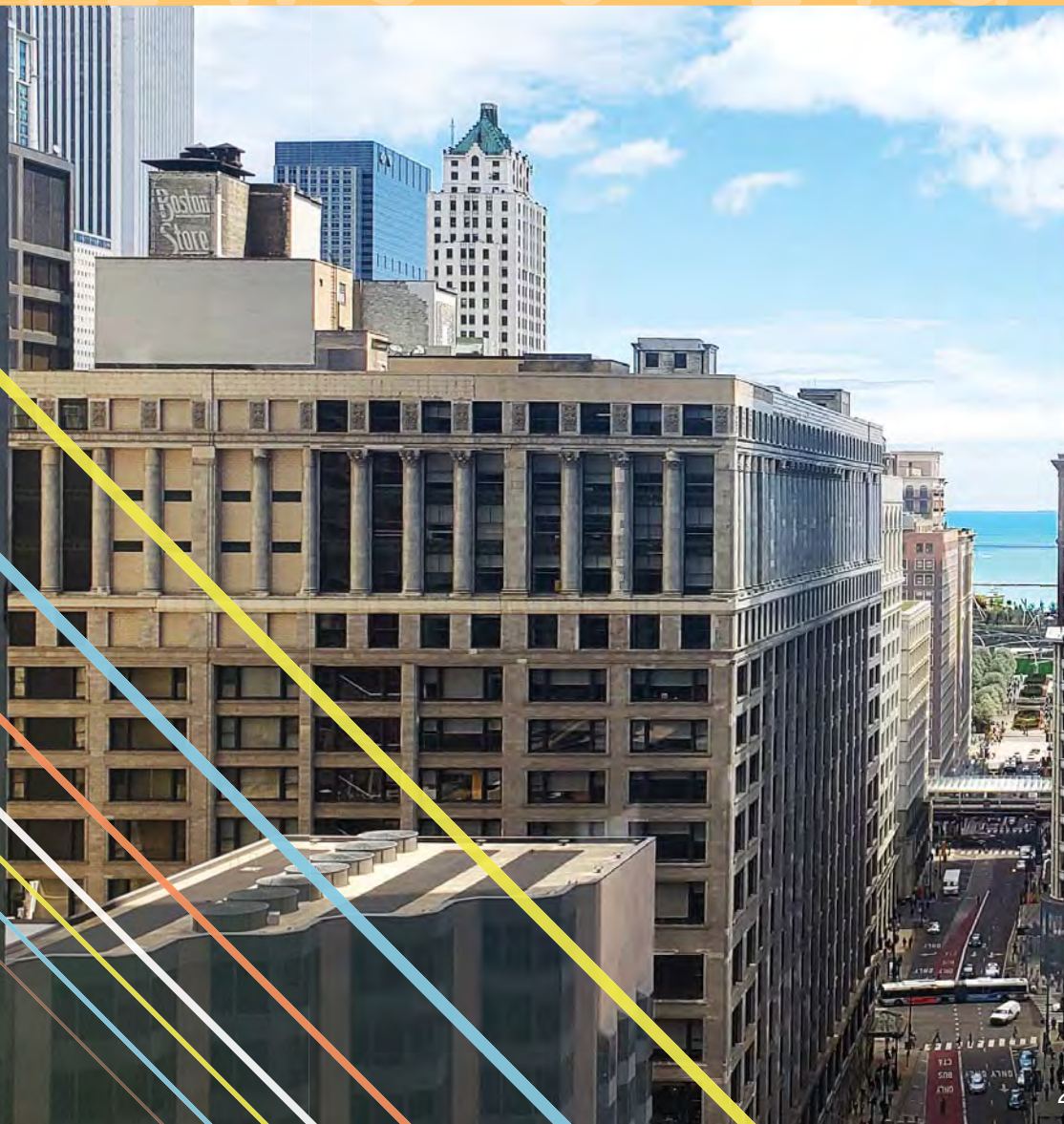
21st floor views to the east